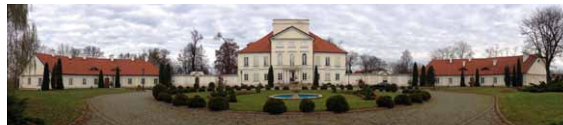
The Ossolinski Palace in Sterdyń